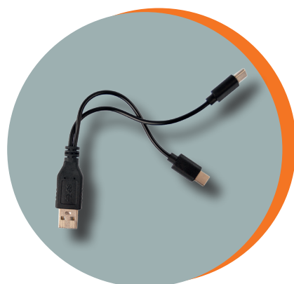
Charging cable to charge both LED elements at the same time