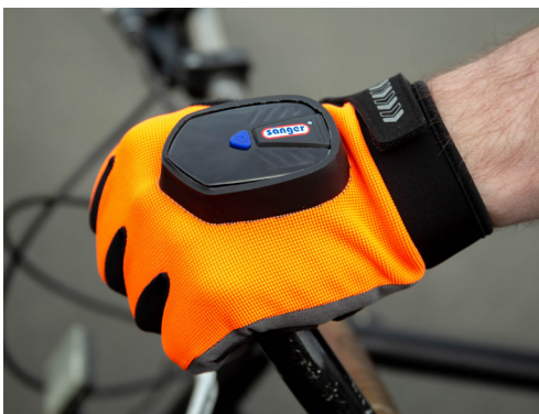
LED light arrow off