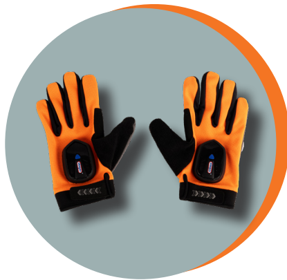
1 pair of gloves orange/blue