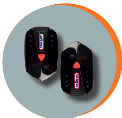
2 waterproof LED elements

Depending on the chosen light function, one battery charge operate for approx. 2 hours. The battery can be charged on a PC or using a transformer at the socket. The charging time is approx. 30 minutes.