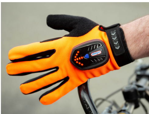
LED light arrow on